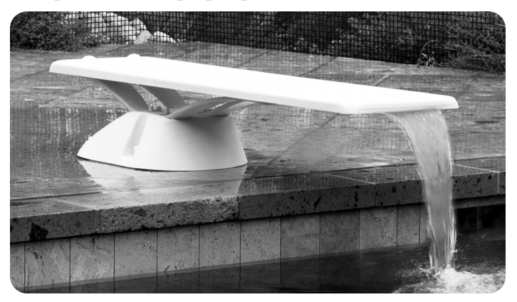
Part # EDGE-BASE (6' & 8' Edge Fiberglass Base & Jig) Part # EDGE-SPRING (6' & 8' Spring Assembly)