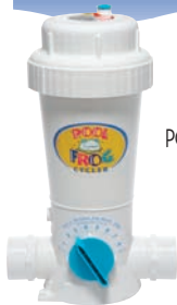
POOL FROG® In Ground System