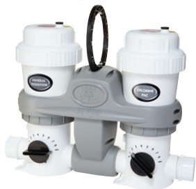
POOL FROG® XL PRO In Ground System with X-tended Pac Life