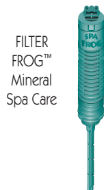
FILTER FROG™ Mineral Spa Care

KING TECHNOLOGY, INC. 952-933-6118 www.kingtechnology.com