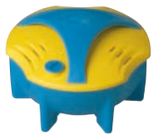
INSTANT FROG® Mineral Sanitizer for In Ground Skimmers