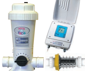
POOL FROG® Mineral Hybrid Combines Benefits of 2 Technologies for Complete Pool Care