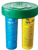
SPA FROG® Floating System Floats in Any Spa