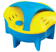
INSTANT FROG® Mineral Disinfectant for In Ground Skimmers up to 25,000 Gallons