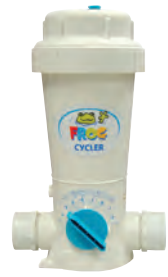
Mineral System up to 40,000 Gallons