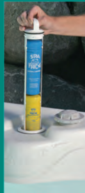
In-Line Mineral System Built In by the Spa Manufacturer for New Spas up to 600 Gallons