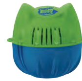
Flippin' FROG™ for Intex® style* above ground pools 2,000 to 5,000 gallons