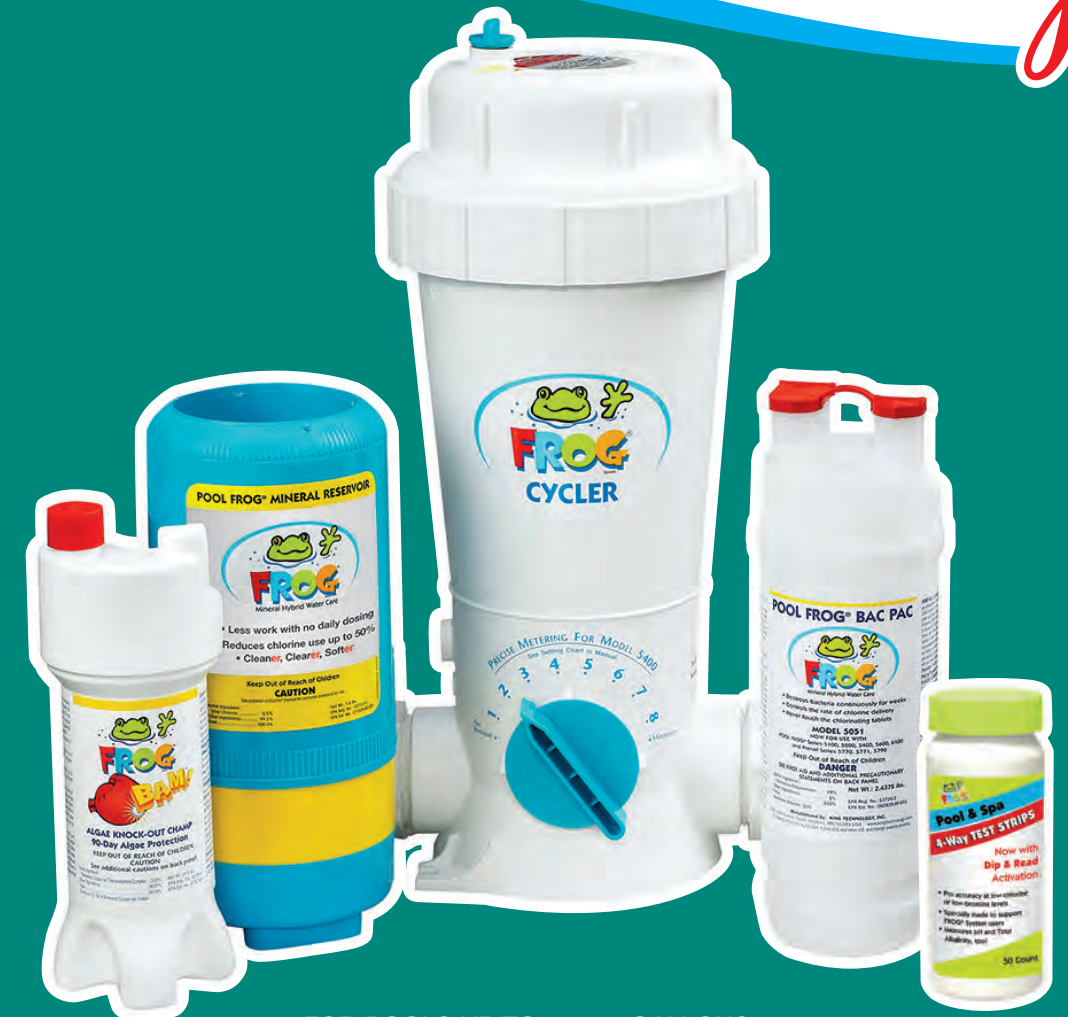
FOR POOLS UP TO 40,000 GALLONS