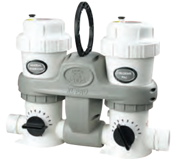
XL PRO System with X-tended Pac Life up to 40,000 Gallons