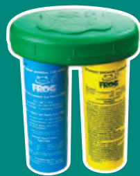
Floating Mineral System Floats in Any Spa up to 600 Gallons