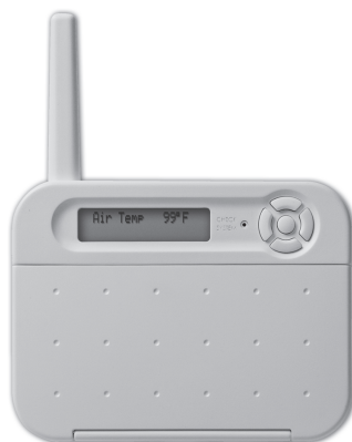
wall mount model