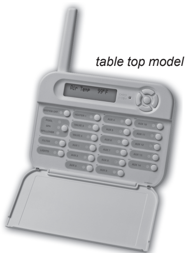
table top model