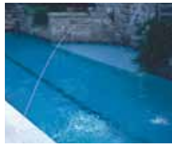
Single 1/4" Stream