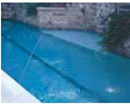
Single 3/16" Stream