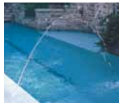
Single 5/16" Stream