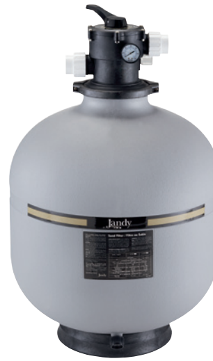
SFTM Top-Mount Sand Filters